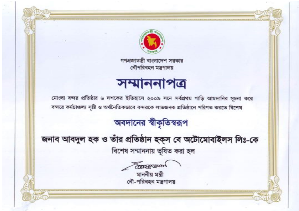
Pic: Recognition letter from the Hon. Shipping Minister of Bangladesh for exemplary role played in Reopening of Mongla Port