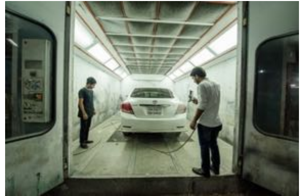
Paint work ongoing in fully equipped paint booth

No single automotive trader in Bangladesh has such comprehensive workshop and support engineering facilities at one place, which will cater all the technical needs of the customers. This facility is now being considered to be expanded and optimally used for other commercial/Industrial operations, like reconditioning of automotive vehicles, using the bonded house concept. Haq's Bay is also