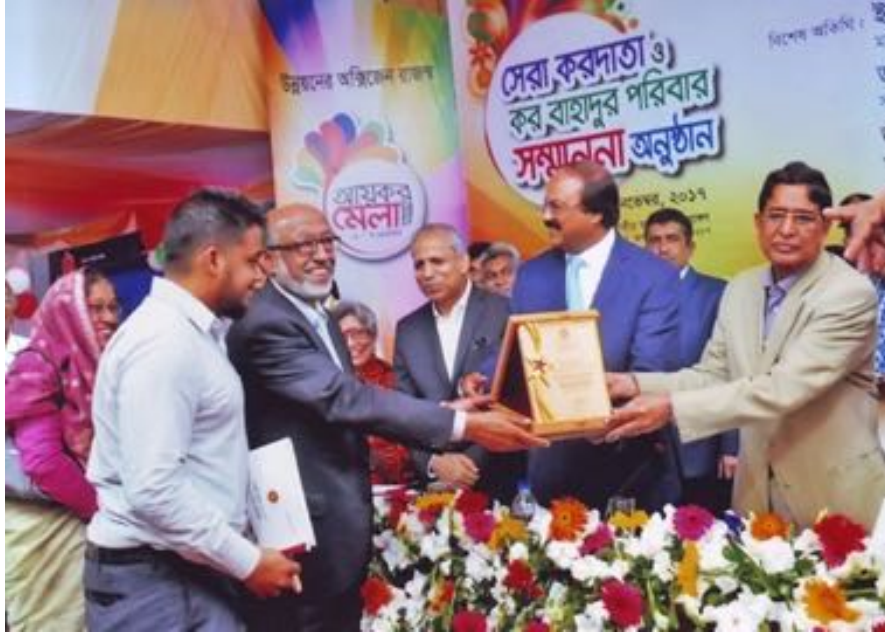
Pic: Receiving recognition from the Govt. of Bangladesh for “কর বাহাদুর পরিবার”