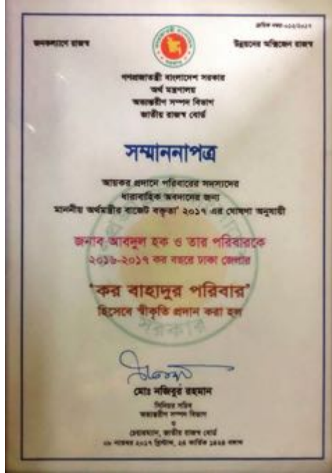
Pic: “কর বাহাদুর পরিবার” recognition from the Govt. of Bangladesh